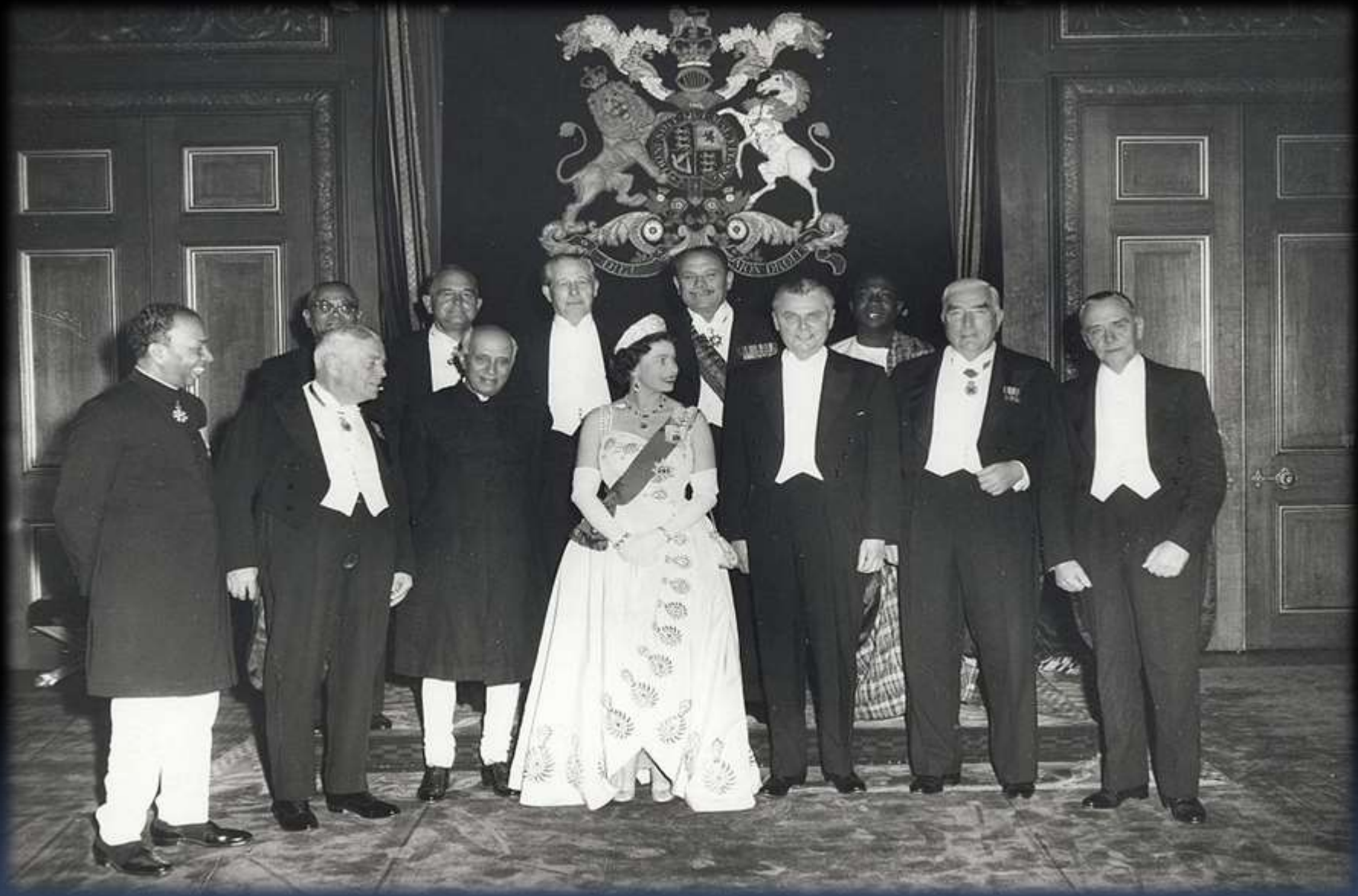
Queen Elizabeth II and the Prime Ministers of the Commonwealth Nations, at Windsor Castle 1960