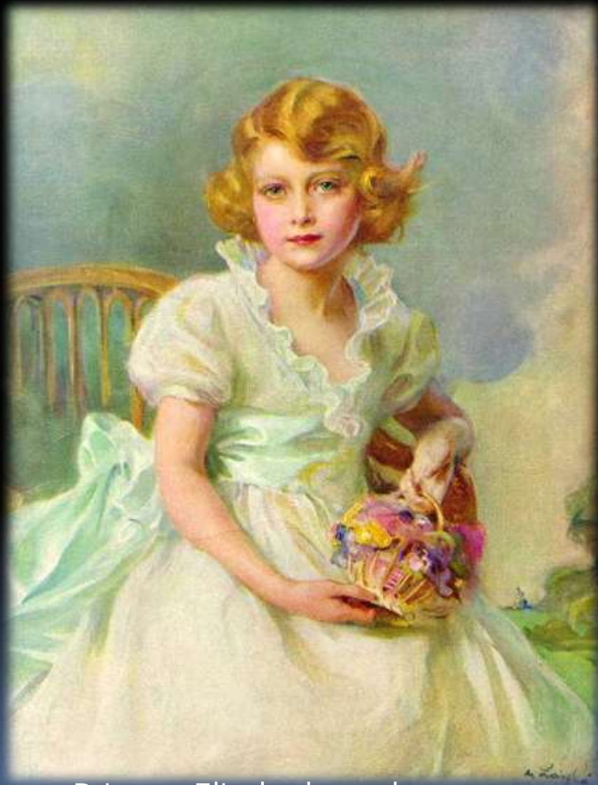
Princess Elizabeth aged seven,

Elizabeth was third in the line of succession to the throne.