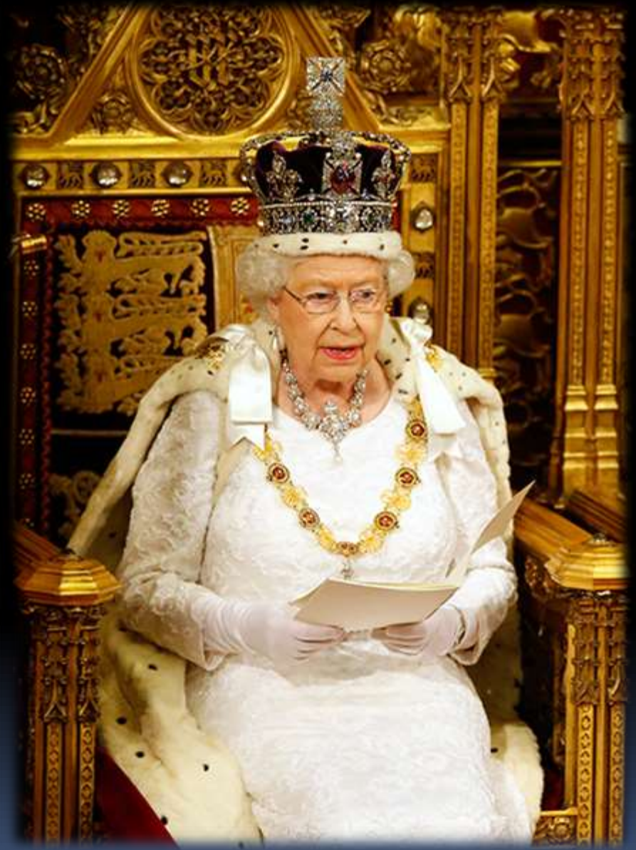
Elizabeth II (Elizabeth Alexandra Mary) was born 21 April, 1926