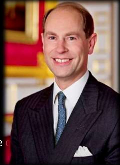
Prince Edward, Earl of Wessex