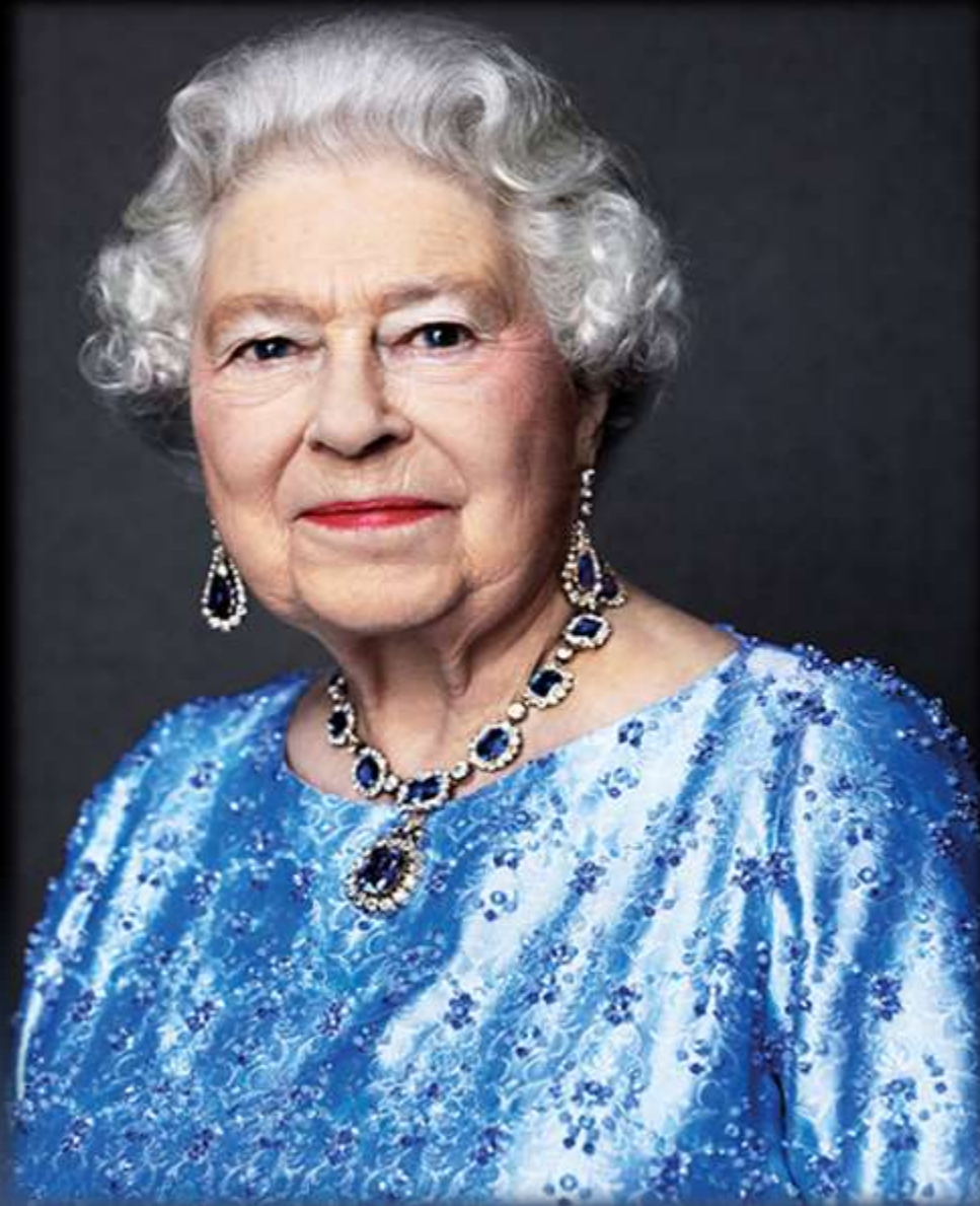
ELIZABETH II, THE QUEEN OF GREAT BRITAIN