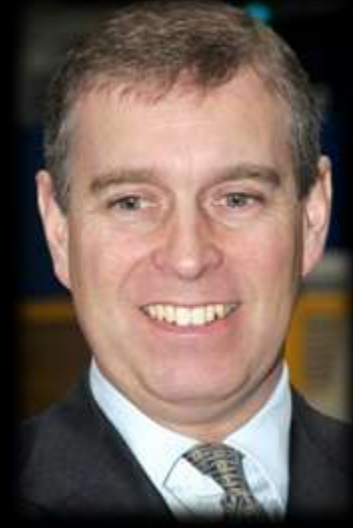
Prince Andrew, Duke of York