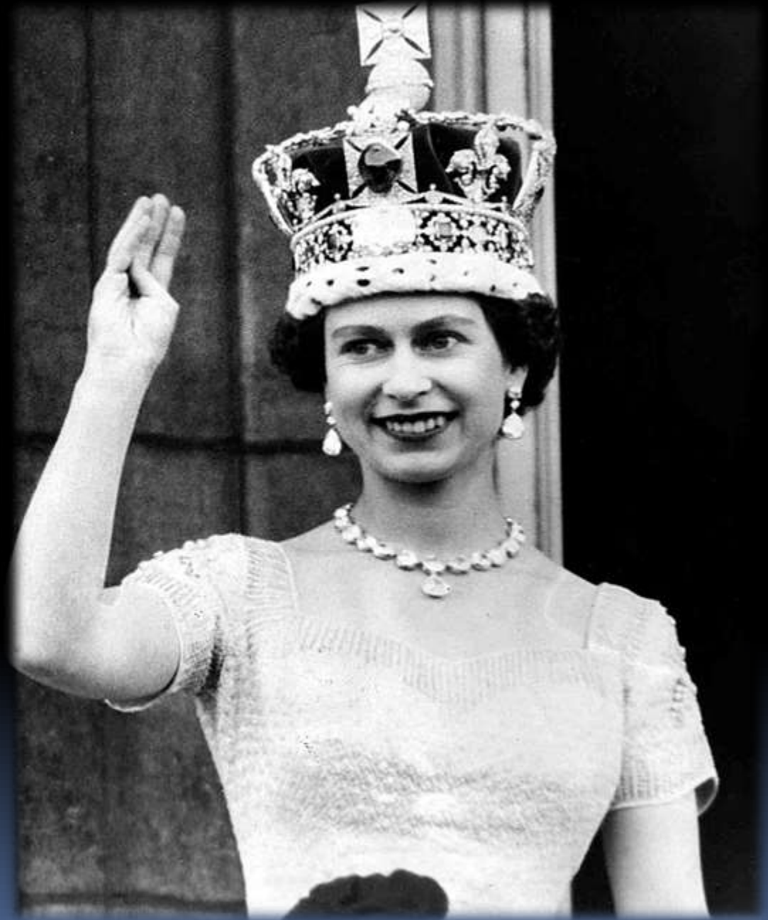
The Queen waves from the palace balcony after the Coronation