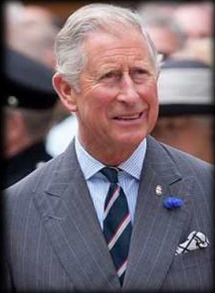
Charles, Prince of Wales