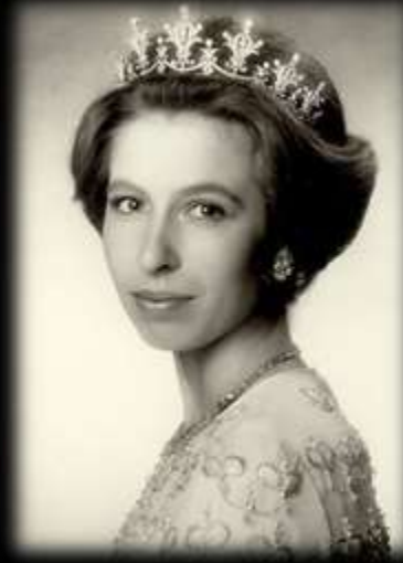
Anne, Princess Royal